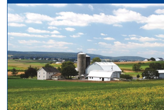
Enjoy the Picturesque Views of Lancaster