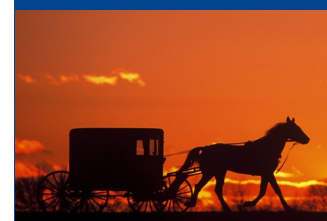
Experience the Amish lifestyle