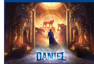
"DANIEL" Show at Sight & Sound® Millennium Theatre®